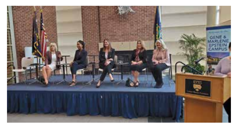
Participating in the Women in Politics panel discussion at Bucks County Community College.