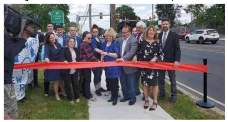
Ribbon cutting to complete the New Falls Road sidewalk project.